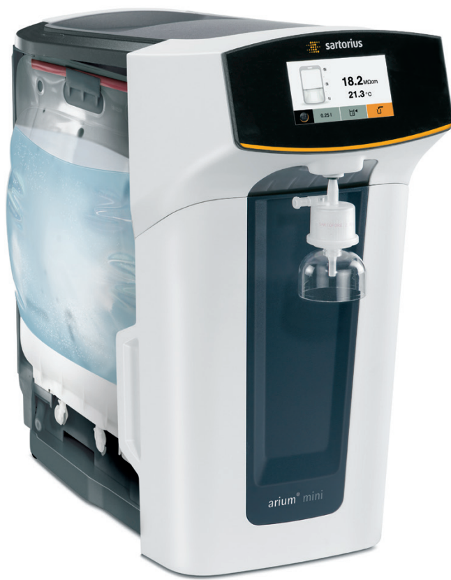
Exemplary representation with open side cover

arium® mini – unique quality "Made in Germany"