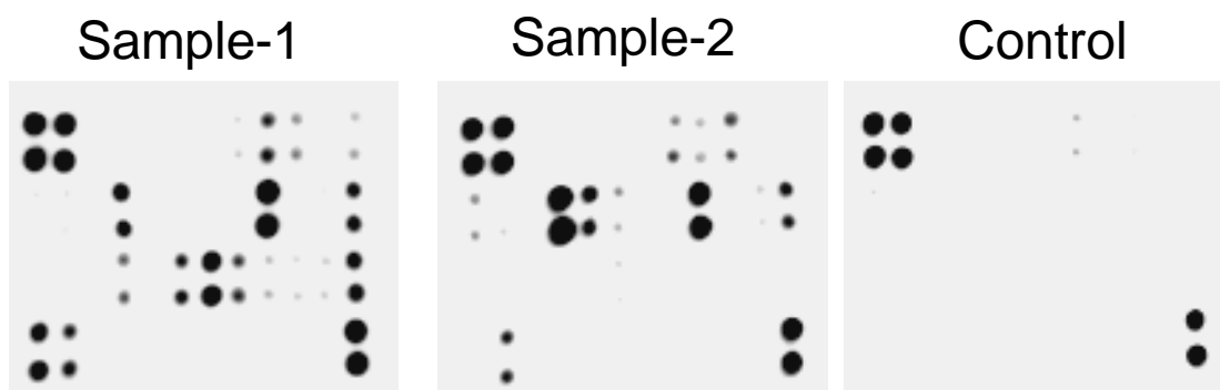
Typical results obtained with RayBio® C-Series Antibody Arrays

The preceding figures present typical images obtained with RayBio® C-Series Antibody Arrays. These membranes were probed with conditioned media from two different cell lines. Membranes were exposed with Kodak X-Omat® film at room temperature for 1 minute.